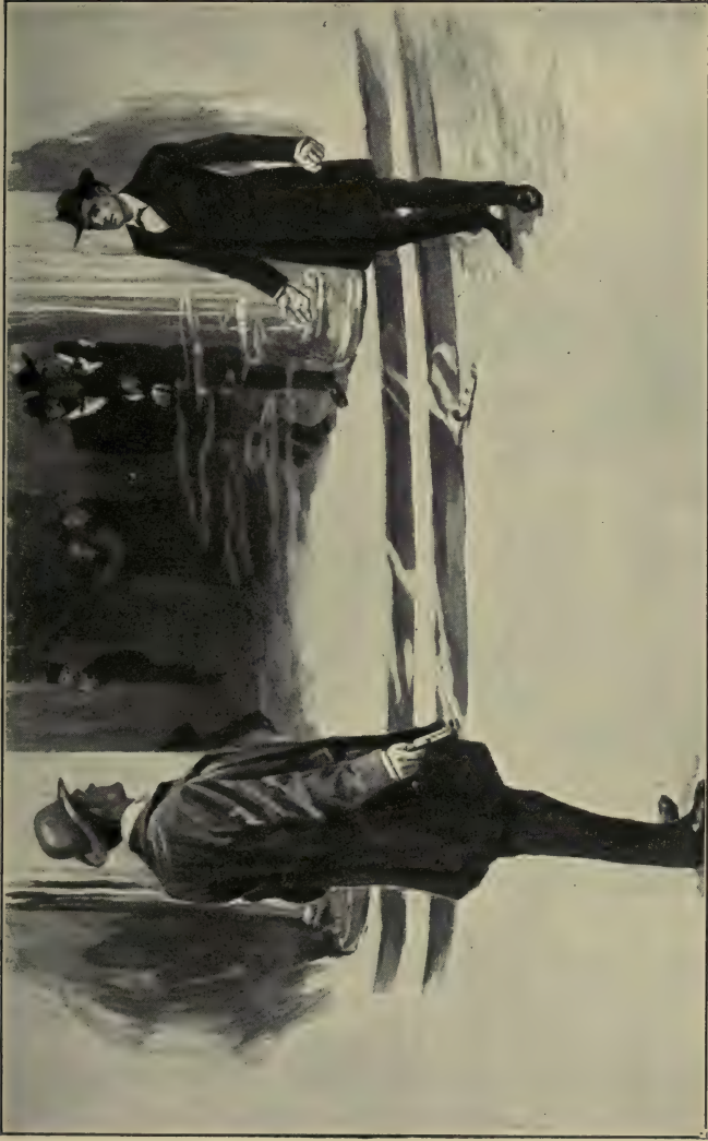
He tossed his weapon aside.